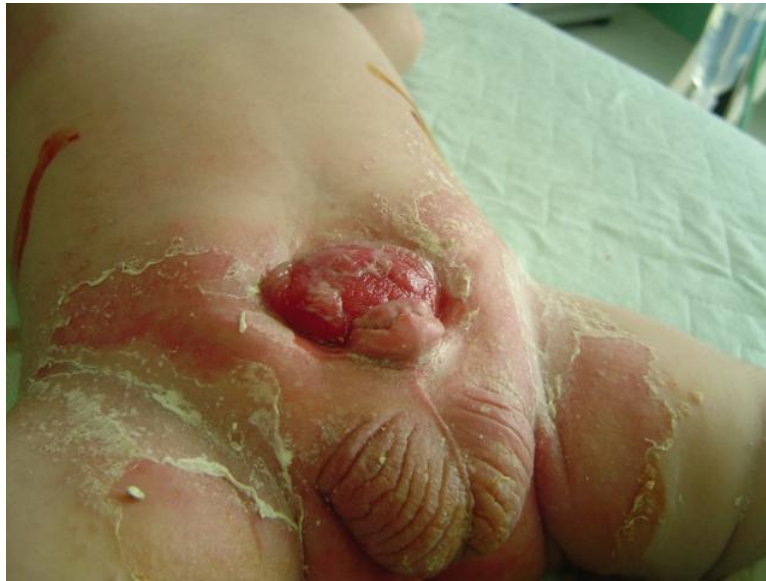
Fig. 1. A classical form of bladder exstrophy.

mention of this abnormality was seen in an Assyrian tablet from 2000 BC preserved in the British museum. It was first described by Grofenberg in 1597 [1,2] .