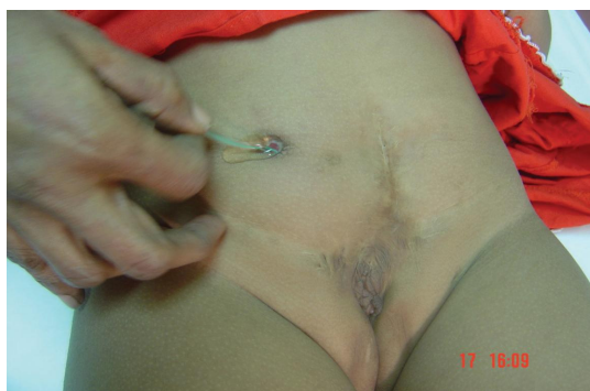
Fig. 4. A female patient's appendix catheterized by the Mitrofanoff procedure.

Out of the eleven patients who survived, good results were seen in four patients (dry period more than 3 h). They were able to empty their bladder spontaneously by supra pubic pressure, the rest were not, the dry period was less than two hours. All cases had their renal function preserved.